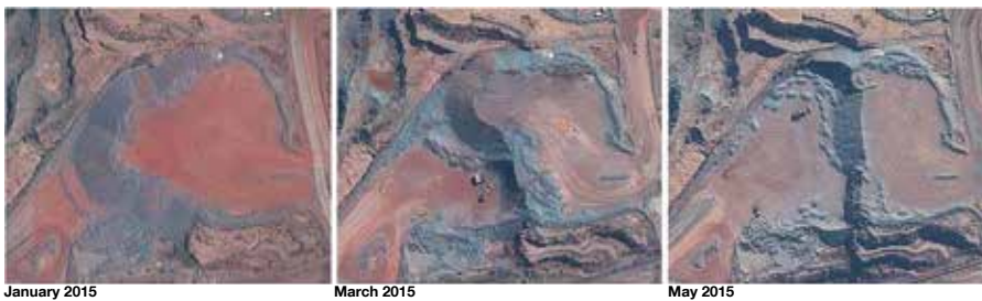
January 2015 March 2015 May 2015 Time-series over the mine for a period of five months.